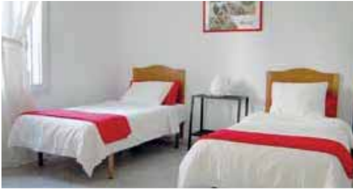
Apartment, studio or host family – you are spoilt for choice. All options are centrally located and within 5 minutes of the beach, city centre and everything else you need!

6 weeks starting from 1.550,- EUR Incl. course & accommodation