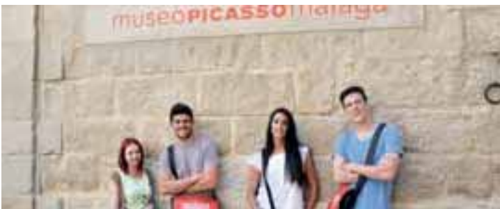
Of course, in Málaga you spend a lot of time at the beach. But the museums – such as the Museo Picasso – are well worth seeing as well.