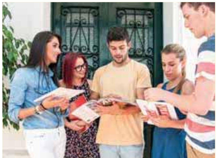
Historic frontage but furnished with modern equipment! The up-to-date school offers you an ideal and diversified study environment.