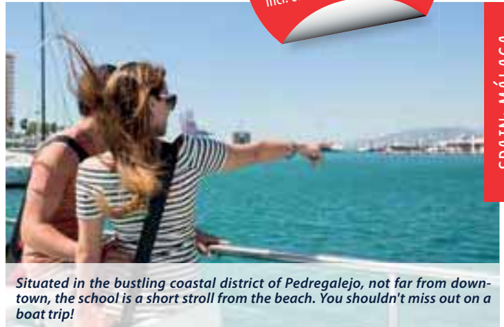
Situated in the bustling coastal district of Pedregalejo, not far from downtown, the school is a short stroll from the beach. You shouldn't miss out on a boat trip!