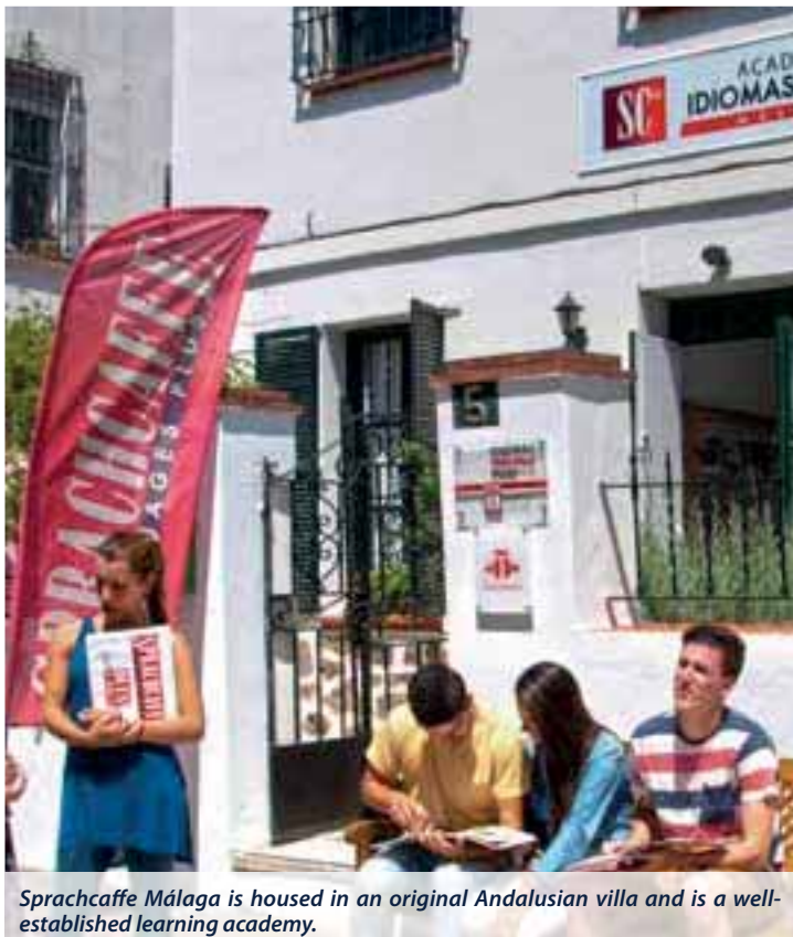
Sprachcaffe Málaga is housed in an original Andalusian villa and is a well-established learning academy.

It goes without saying that Costa del Sol is described as one of the favourite destinations – sunshine guaranteed.